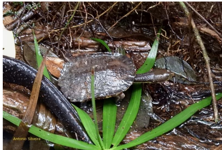
Photo 2- Hydromedusa maximiliana